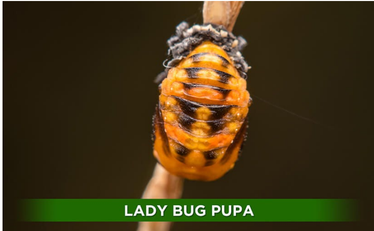
LADY BUG PUPA

USE: Lady bugs prefer to eat aphids and will devour up to 50 a day, but they will also attack scale, mealy bugs, boil worms, leafhopper, and corn ear worm. They dine only on insects and do not harm vegetation in any way.