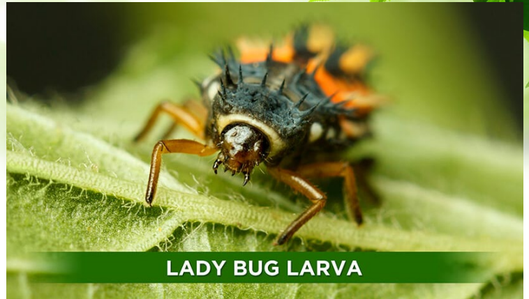
LADY BUG LARVA

It is normal for there to be several dead Ladybugs in the container, especially those received from March through May. These bugs have reached the end of their life cycle. We have included many extra bugs to compensate for this.